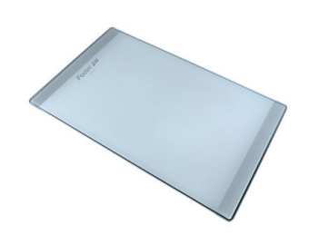
Glass chopping board