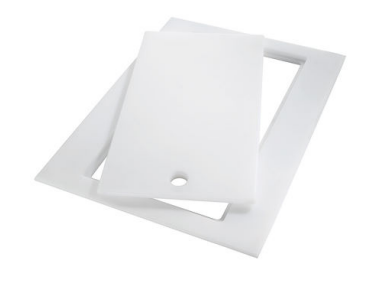
HPDE Twin chopping board