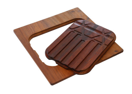
Iroko-wood twin chopping board