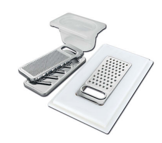
Graters kit with ring-holder and food collection tray