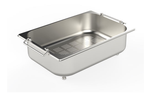
Stainless steel colander