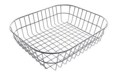
Stainless steel basket