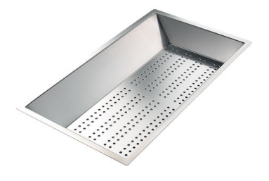
Stainless steel perforated tray