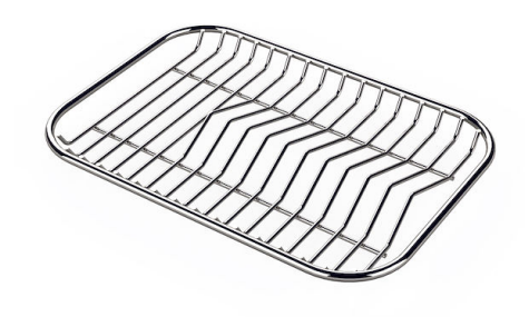
Stainless steel plate rack