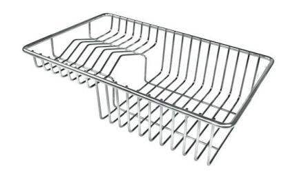
Stainless steel plate rack