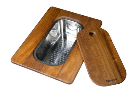
Iroko-wood sliding chopping board with stainless steel colander