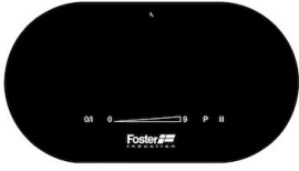
Cooker hob Touch Control Modular Induction 7368 020