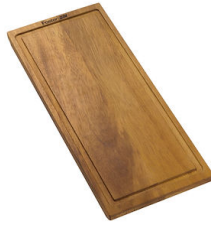
Walnut-wood chopping board