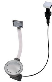
Space automatic waste fitting