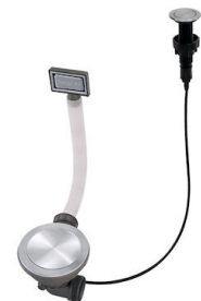
Space Push automatic waste fitting