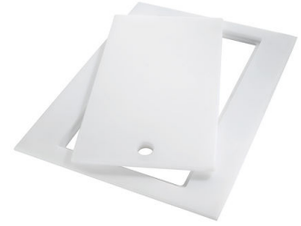
HPDE Twin chopping board