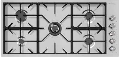
Cooker hob Foster Milano