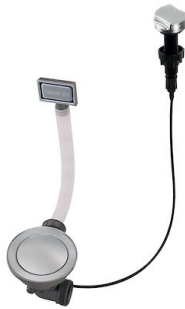
Space automatic waste fitting