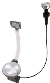
Space Milano automatic waste fitting