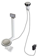
Space Light automatic waste fitting