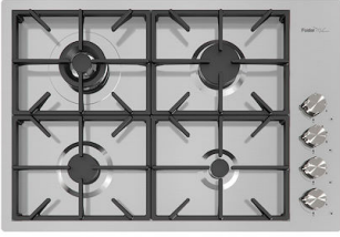
Cooker hob Foster Milano