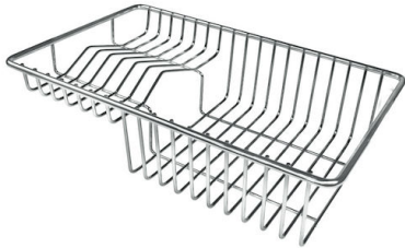
Stainless steel plate rack